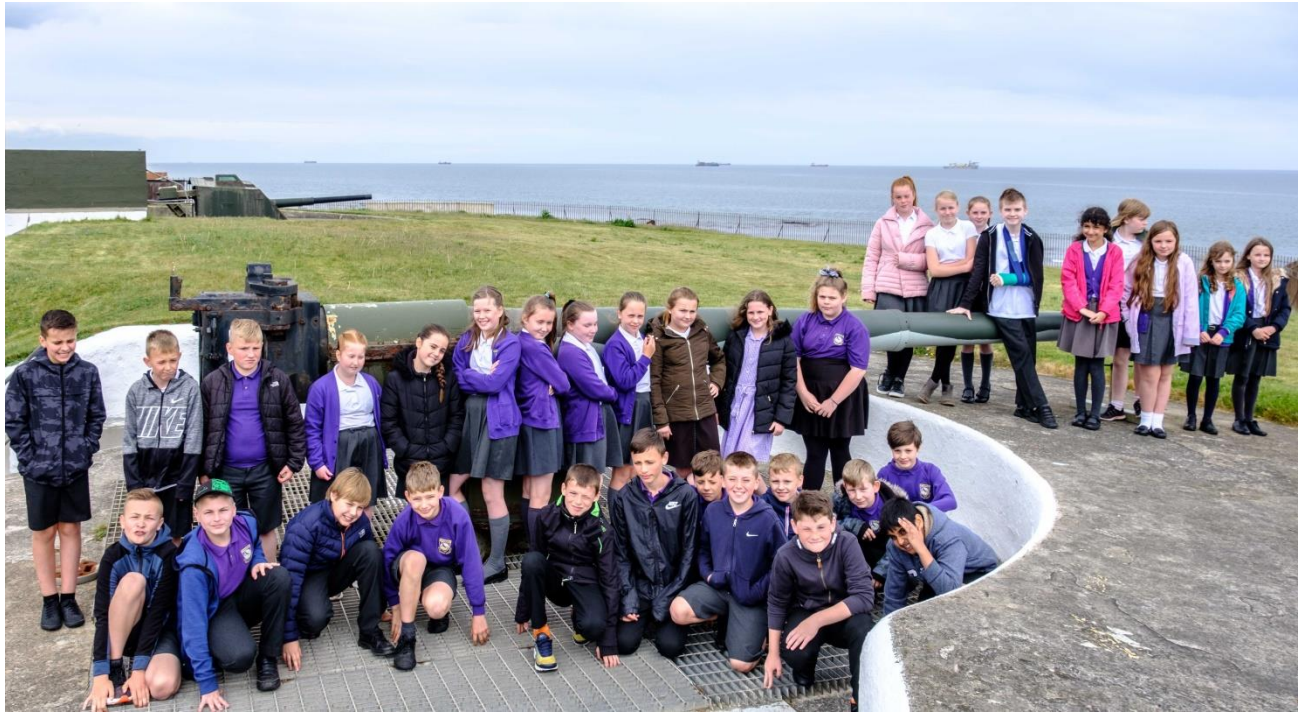
Year 6 at Heugh Battery Museum, Hartlepool